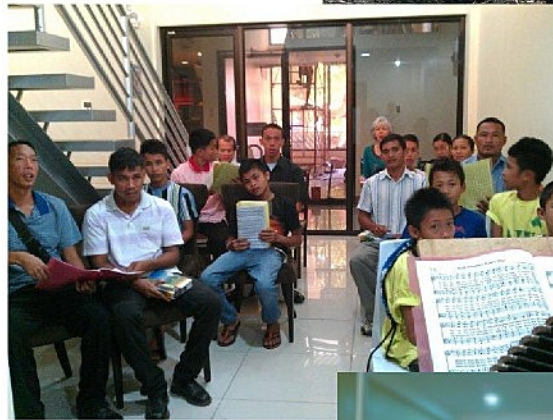
Photo # 4. In order to properly train our young men and ladies in the operation of a local church we have begun holding services in what we pray will be blessed of the good Lord and provide dual-language Bible believing ministry to many in our local area. Our first service in a rented hotel conference room squeezed in 26. Photo #5 shows the SS kids on the loft above. We have since rented our own facility and are now a full-function church. If you want to see photos of the church go to:

https://plus.google.com/114269611963048733707/posts/p/pub?hl=en&partnerid=gplp0